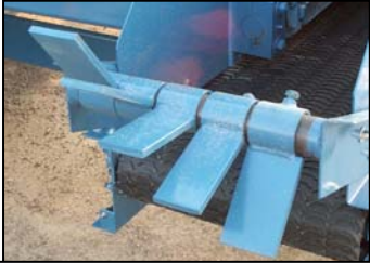
adjustable sand deflectors on discharge