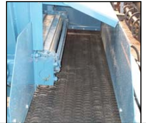
discharge belt conveyor (pto driven)